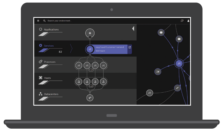
Full stack visibility with Dynatrace's Smartscape®

Available as an on-premise managed solution or a SaaS solution, Dynatrace lets you choose based on your company's requirements.